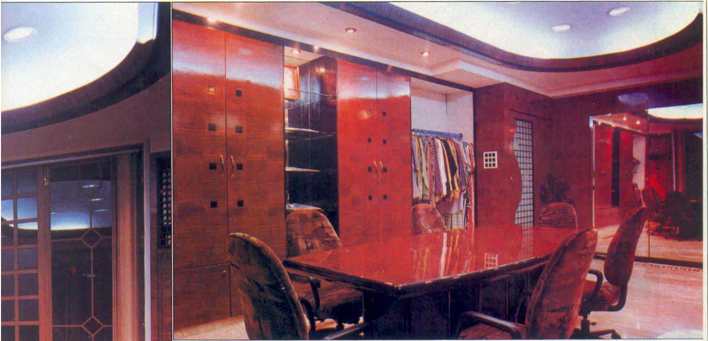
The warm and relaxed ambiance of the showroom allows the clients to feel comfortable while viewing the products