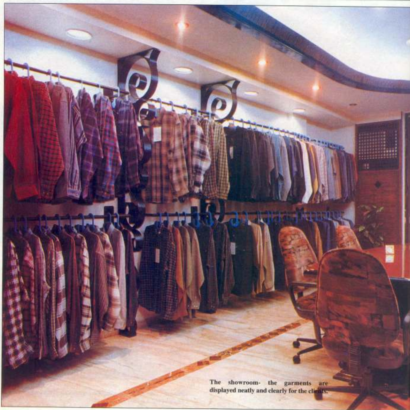
The showroom- the garments are displayed neatly and clearly for the clients.